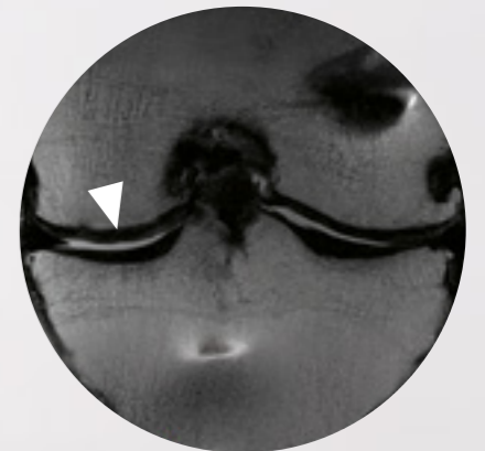
Cartilage implant, 6 months post-operative