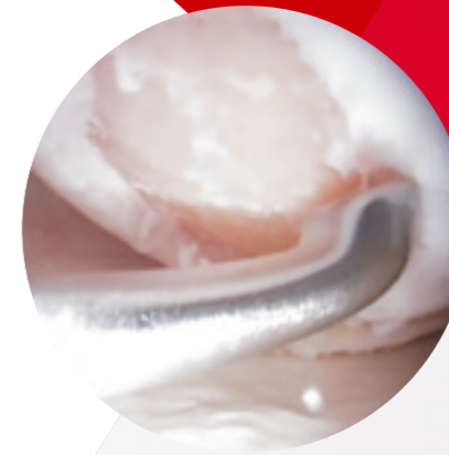
Debridement of the defect